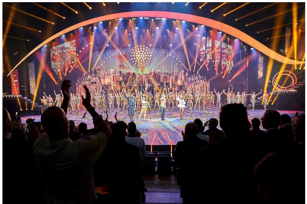
Pure elation: endless applause and praise for the new ARISE Grand Show

An audience of 1,267, which included countless high-profile guests from society and politics, celebrated the World Premiere of the ARISE Grand Show at the Palast today with lengthy ovations. The limited seating with only two thirds of the seats occupied did not dampen the mood – the audience was electrified from the moment the curtain went up. With a production budget of 11 million euros, the ARISE Grand Show is the most elaborate World Premiere in terms of personnel and technology since March 2020.