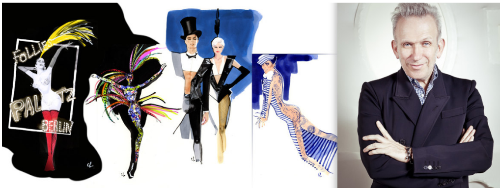
Sketches by Jean Paul Gaultier of costumes for THE ONE Grand Show