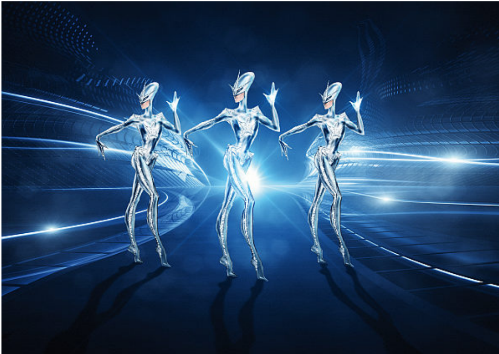
Alien kickline | Illustration by Manfred Thierry Mugler

They are among us. Anyone who drifts through the parallel universes of the Berlin nightlife can sense it. Life forms of all stripes are attracted to the 'anything goes' attitude of this city. Among them, a BMX rider and an unsociable lady who lives at the top of the TV tower and feels closer to aliens than terrestrial folk. Two souls, as close and yet as far apart from each other as possible. A love between heaven and earth must overcome gravity. This requires higher powers such as Nefertiti, Berlin's best known inhabitant worldwide. Her name means 'the Beautiful one has come'. But where did she come from? And what has kept her young these 3,400 years?