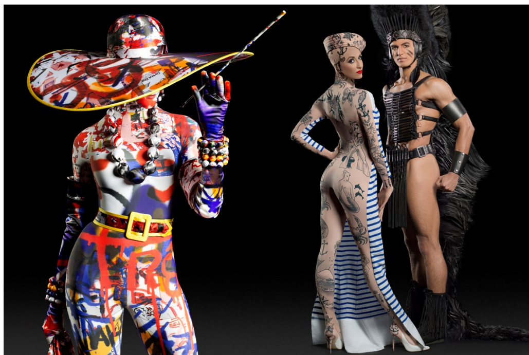
Costumes for THE ONE Grand Show by Jean Paul Gaultier